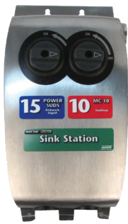
Sink Station for three basin sink cleaning of pots and pans.