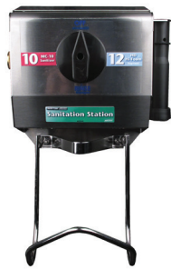
Sanitation Station for meatroom operations.