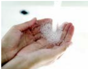
Foaming Dispenser Smoke, part number 421915

Air-infusing system dispenses 0.7-mL of thick, rich foamy soap per pump. Refillable 1200mL (40.5oz) bulk fill tank included with each dispenser.