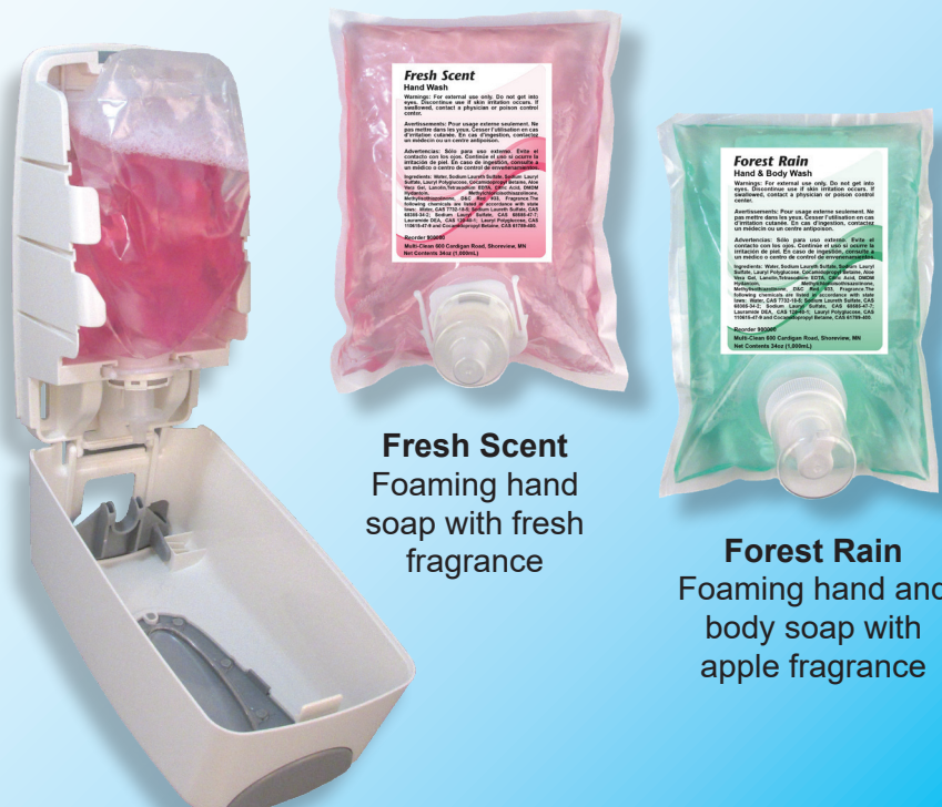
Fresh Scent Foaming hand soap with fresh fragrance

Foaming hand and body soap with fresh fragrance, in sealed 1,000 mL cartridges, are easy to install. Sealed refills eliminate potential contamination.