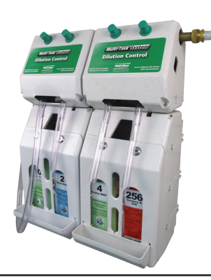
Connect two units together to create a secure 4 product dispenser. Item 421700