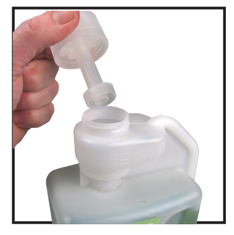
Proprietary cap design activates the Multi-Task system.

E-Gap technology mixes water with product while conforming to ASSE 1055B approved backflow prevention.