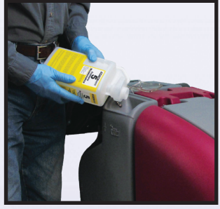
Squeeze N Pour