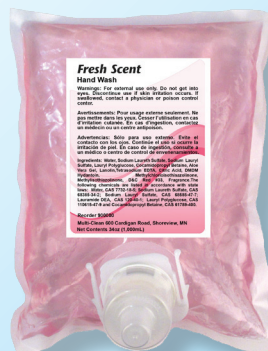
Fresh Scent Foaming hand soap with fresh fragrance

Foaming hand and body soap with fresh fragrance, in sealed 1,000 mL cartridges, are easy to install. Sealed refills eliminate potential contamination.