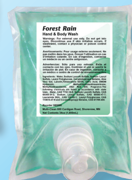
Forest Rain Foaming hand and body soap with apple fragrance