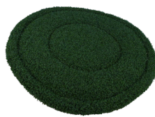
Green Turf pad