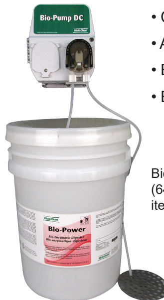
Suggested configuration shown