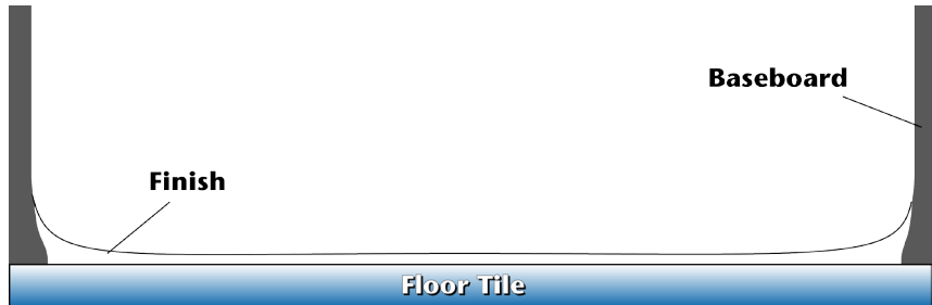
Illustration shows finish and build-up along walls and baseboards