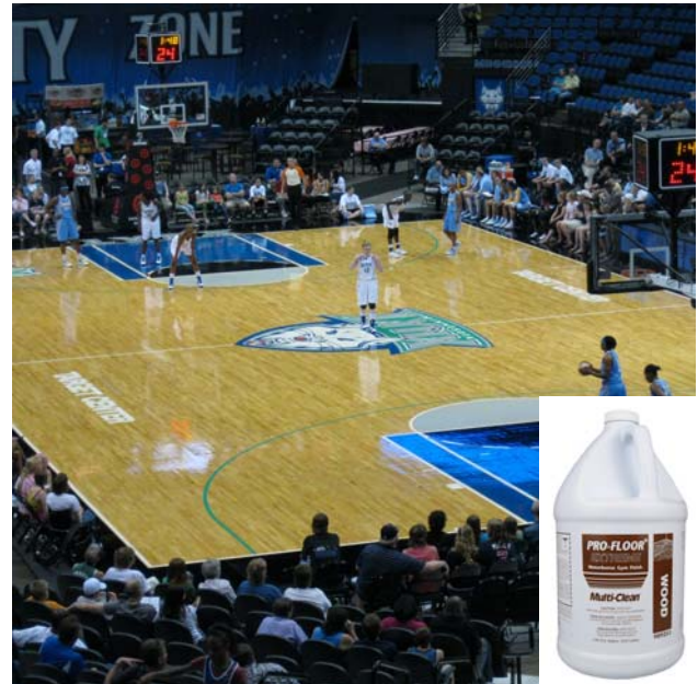
2011 WNBA Champions - Minnesota Lynx. Target Center floor coated with Pro-Floor Extreme April 2010.

NOTE: Some parquet floors should not be finished with polyurethane coatings. Check with floor manufacturer before using on parquet floors.