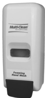
Foaming Soap Dispenser, White, part 421850

Wall mount Foaming Hand Soap Dispensers give you instant foam.