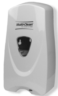
Touch Free Soap Dispenser, White, part 421858