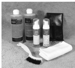
Foaming Spotter Kit Part Number: 902222