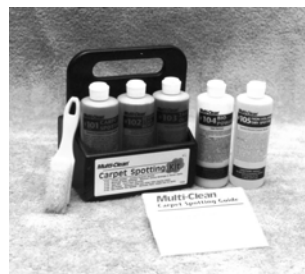
Carpet Spotting Kit Part Number: 902000

Carpet Spotter loosens spots for quick removal and does not leave a sticky residue behind to cause resoiling.