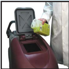
Squeeze N Pour